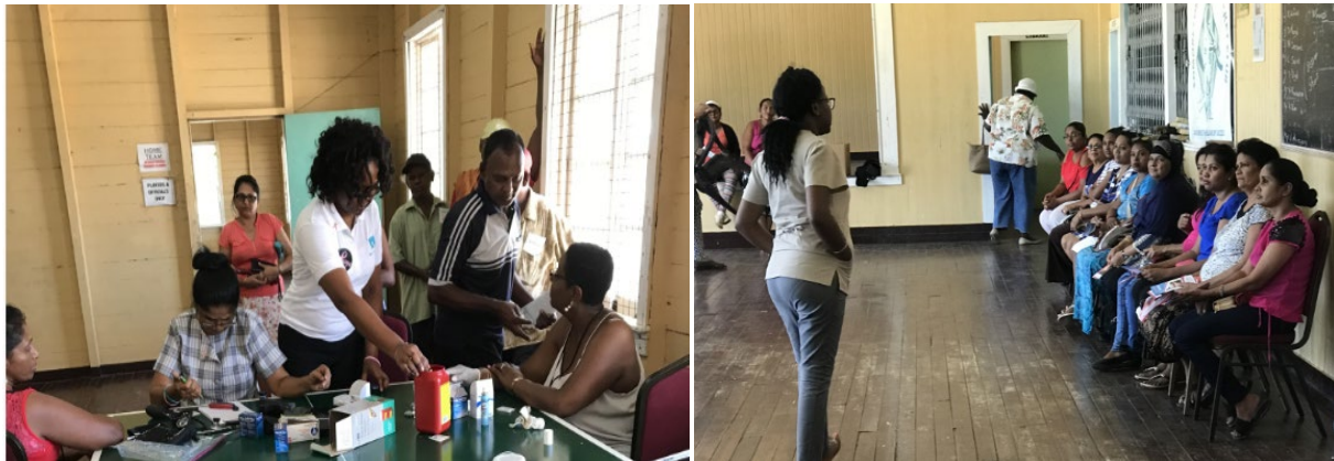
Free Cancer Screening at the Enmore Community Center

Community members came out in numbers to be checked. Referrals when necessary were issued for the relevant Care Providers.