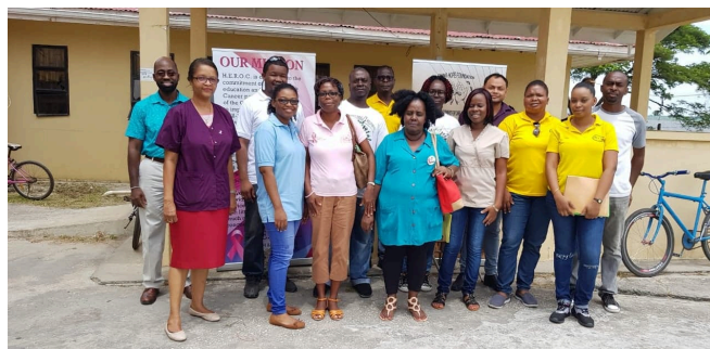
GHF team and volunteers from the BV/Triumph community after the event.