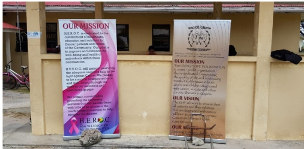
Banners of the two organizations on display