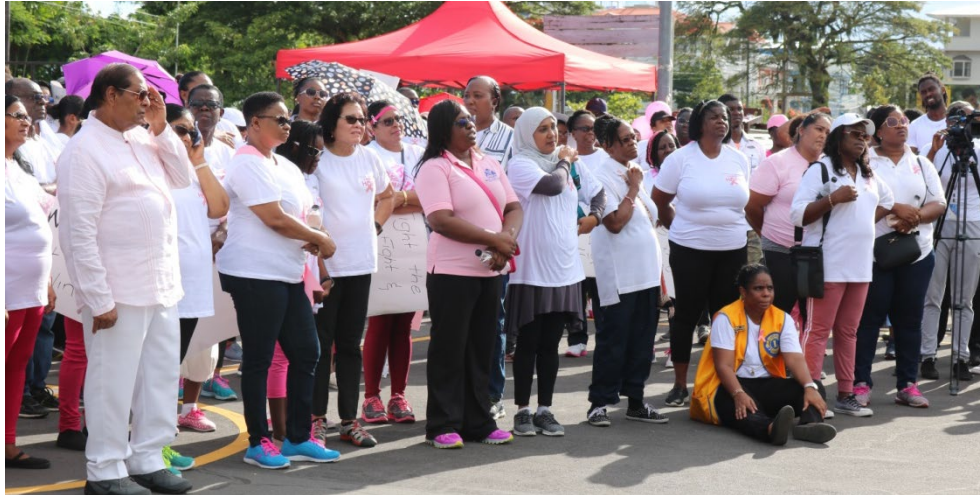
Cancer Awareness Walk supported by Members of the Government, including the First Lady- Mrs. Sandra Granger, Prime Minister - Mr. Moses Nagamotoo, Minister of Public Health – Ms. Volda Lawrence who is a Cancer Survivor and Junior Minister of Public Health, Dr. Karen Cummings

Public Health, The Giving Hope Foundation and H.E.R.O.C. teams. In addition, many participants and corporations joined in this venture. Prime Minister, Mr. Moses Nagamotoo joined us along the way and all participants were very excited to be a part of this Cancer awareness effort. A big THANK YOU to ANSA MCAL for the supply of water for the walk.