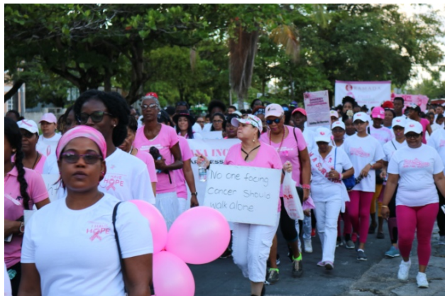
Section of the participants at the walk