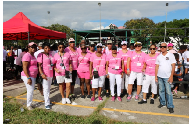
Team H.E.R.O.C. at the conclusion of the walk