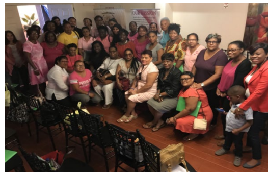
Coordinators and participants at the Workshop