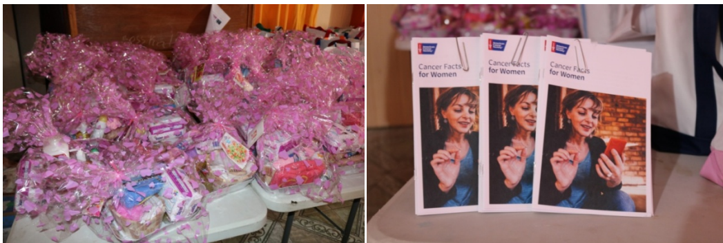
Additional Hamper Gift Sets including Cosmetics and Make-up were compliments of Muneshwer's Ltd., Georgetown, Guyana