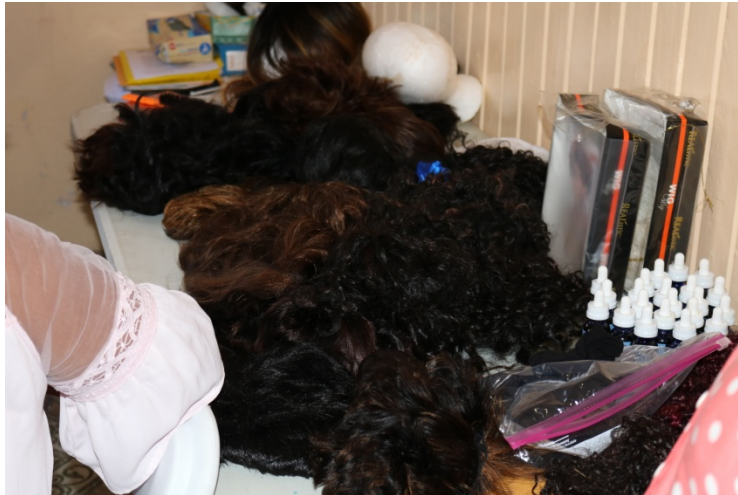
Wide variety of wigs and cosmetics for distribution and use by our guests.