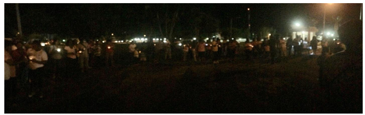
Section of the supporters at the Candle light Vigil

Saturday, October 28 - Giving Hope Foundation with the assistance of H.E.R.O.C.