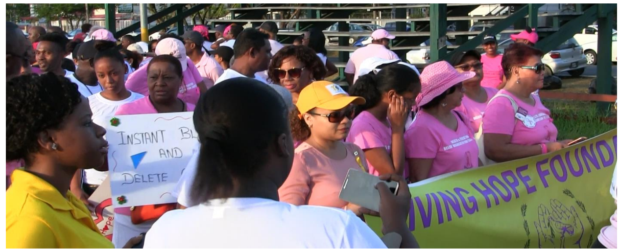
Giving Hope Foundation and H.E.R.O.C Inc. Teams heading the walk