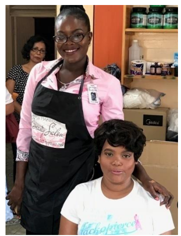
One of the Cancer Patients Before and After their make-over

They were provided with lunch and the gift bags were distributed to everyone prior to their departure. This was an exciting day and we were so pleased that we were able to make the hearts of these women so happy.