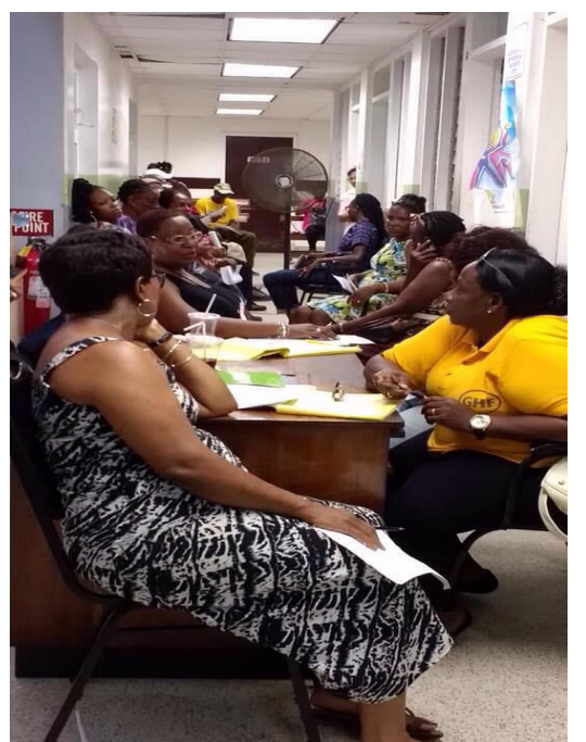
At the free Cancer Screening

Saturday, October 28 - Giving Hope Foundation with the assistance of H.E.R.O.C.