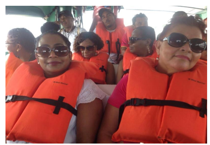
Some of our members aboard the Speed Boat headed to Bartica

The Bartica Mission Trip was indeed an adventure but we needed to present a program to the Administrators of the Hospital and nothing was going to stop us. We arrived in Bartica through pouring rain. It was an experience disembarking from our Speed Boat into puddles of water, but we were there for a purpose and we continued on to the Hospital.