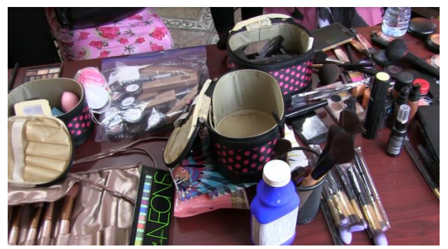
Wide variety of wigs and cosmetics for distribution and use by the Survivors/Patients

Our guests were all transformed to a point where they were unrecognizable. At the end of the session, the survivors and patients were very anxious to get home with their new look.